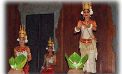
Apsara Dance Performance , Khmer classical culture dance