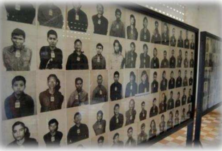
Tuol Sleng Genocide Museum (S-21 prison) chronicling the Cambodian genocide.