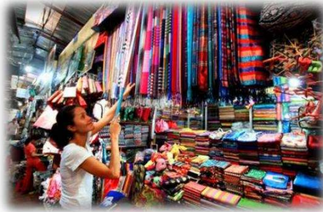
Russian Market , one of the best markets in town to buy fabric, also carries huge selection of curios, silks and carvings