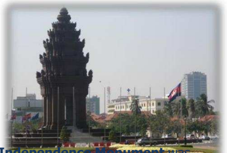
Independence Monument was built in 1958 for Cambodia's independence from France in 1953.