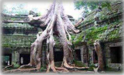
Ta Prohm Temple or known as Tomb Raider temple (Originally dedicated to the mother of the king Jayavarman VII) and restoration by Archaeological Survey of India (ASI), supported by India Government