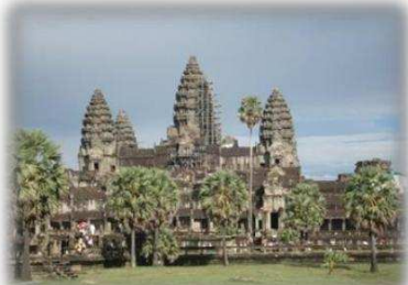
Angkor Wat Temple , the largest religious monument in the world, with the site measuring 162.6 hectares