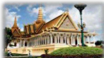
Royal Palace (Constructed in 1866, serves as the royal residence of the king of Cambodia)