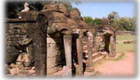
The Terrace of Elephant (Used as the royal reception pavilion during the reign of King Jayavarman VII for celebration of royal events and built as a platform from which to view victorious returning army)