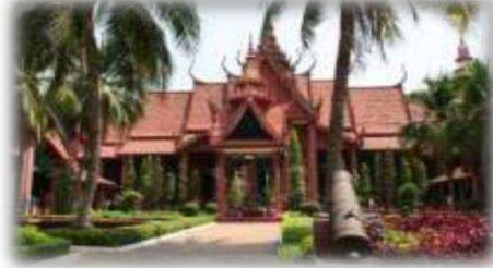
National Museum (Museum was officially inaugurated in 1920, and renovated in 1968, collection includes over 14,000 items)