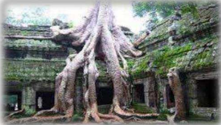
Ta Prohm Temple or known as Tomb Raider temple (Originally dedicated to the mother of the king Jayavarman VII) and restoration by Archaeological Survey of India (ASI), supported by India Government