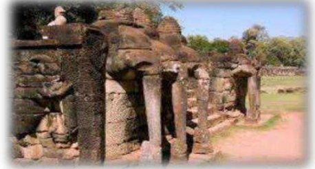
The Terrace of Elephant (Used as the royal reception pavilion during the reign of King Jayavarman VII for celebration of royal events and built as a platform from which to view victorious returning army)