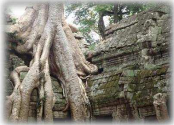
Ta Prohm Temple cloaked in dappled shadow, its crumbling towers and walls locked in the slow muscular embrace of vast root systems.