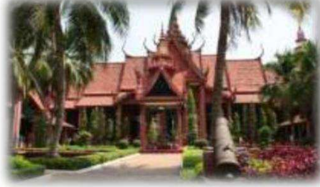
National Museum (Museum was officially inaugurated in 1920, and renovated in 1968, collection includes over 14,000 items)