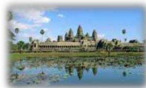
Angkor Wat Temple (Originally dedicated to Vishnu god, the icon of Khmer civilization, UNESCO World

Southeast Asia and is an ecological hot spot was designated as a UNESCO biosphere in 1997)