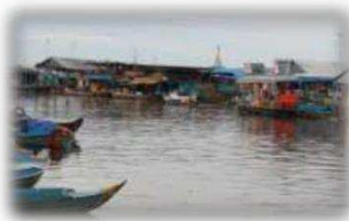
Floating village of Tonle Sap Great Lake (the largest freshwater lake in